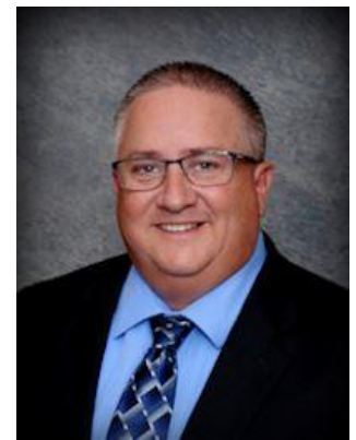
Mayor Pro-Tem Rick Crosby