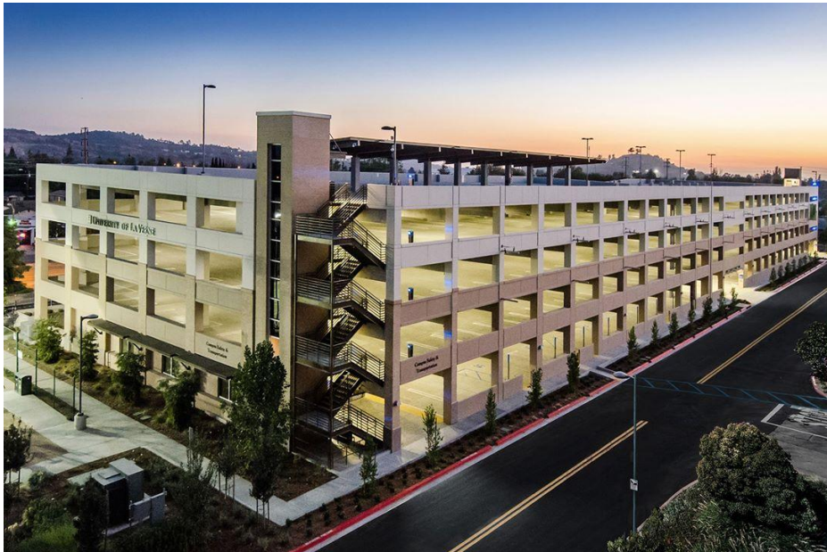
2017 La Verne Community Design Award in the Institutional category – ULV Parking Structure