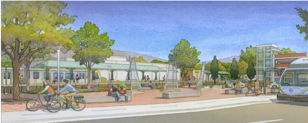
Artist rendering of future La Verne Gold Line Station